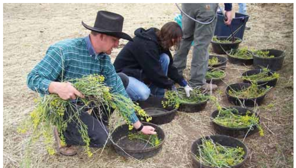
Trainers preparing pots with a variety of Canada thistle, leafy spurge and spotted knapweed to feed heifers