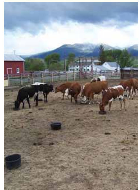
Cows at work at Grant-Kohrs Ranch NHS managing land resources